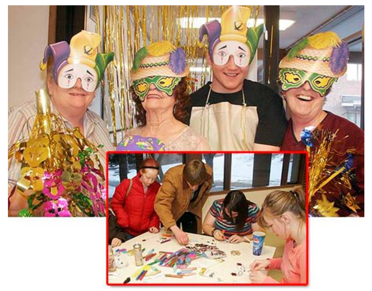
MSU-Northern's Food Service conducted a Mardi Gras evening last night in the dining room. Students made masks to wear while they ate some old time favorites like Jambalaya Fettuccine, Catfish Po boys on a hoagie, Smoked spicy pork roast, Red beans and rice, Hush puppies, and Okra.