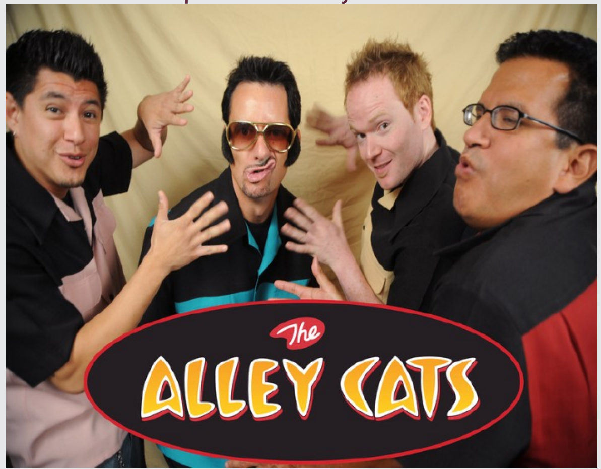
The Alley Cats will perform at the Havre High Auditorium April the 9th at 7:30 p.m. This will be the

Northern Showcase presents The Alley Cats