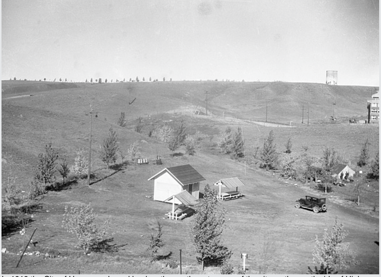
In 1918 the City of Havre purchased land on the southwest corner of the city on the south side of Highway 87. The city planned to expand the water system and develop a park. In 1920 the Havre Welfare Club built a shed, installed picnic tables, and landscaped parts of the area to provide a Tourist Park for visitors to the