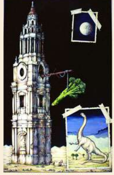
Artitudes Gallery Reception: Friday, Oct. 10, 2014 6 PM