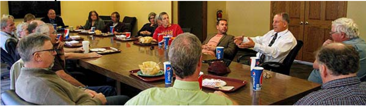
The MSU-Northern's faculty union leadership had a lunch meeting with Northern's top administrative leaders to welcome them on board and show their support.