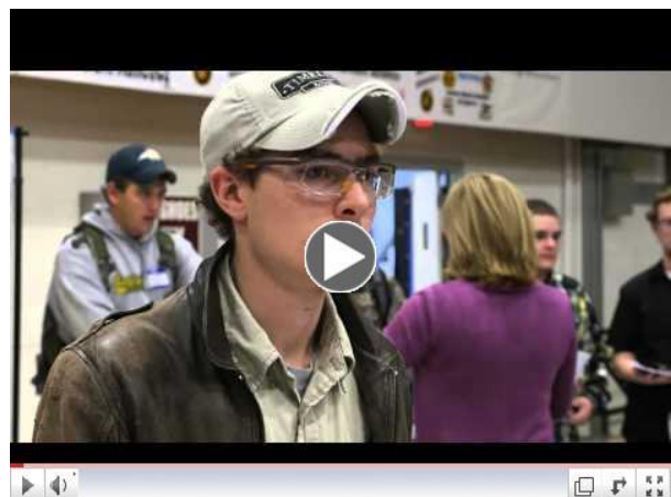
2015 Fall Career Fair

The Career Center thanks everyone for their help in setting up and tearing down for the big day. A special thank you goes out to all of the crews in the Athletic Department, Physical Plant, University Relations, Food Services, Event Coordinator, Media Center, Vande Bogart Library, Bioenergy Center, Advising Center, IT Department, and the faculty who brought students to